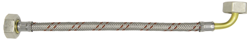
Female with gasket inserted